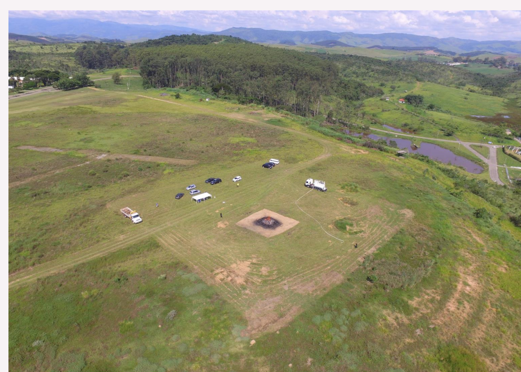
Figure 1: (a) View of experimental plot located at the INPE facility in Cachoeira Paulista-SP/Brazil (44.999°W 22.686°S); (b-c) atmospheric profiles derived from radiosonde and MERRA-2 reanalysis data on 05 July 2017 to correct near-coincident S-NPP/VIIRS fire pixel radiances.

We deployed a custom-made broadband spectral radiometer along with a commercial off-the-shelf infrared cameras (e.g., FLIR VueProR, Zenmuse XT) mounted to small consumer drones (e.g., DJI's Phantom series) flown over small prescribed burns implemented so as to coincide with the overpass times of different Earth observing satellites (e.g., NASA Terra & Aqua, NOAA/NASA S-NPP, USGS Landsat-8, and ESA Sentinel-2). Near-simultaneous fire radiative power (FRP) retrievals were obtained using the airborne and spaceborne data acquired during prescribed fires conducted in grasslands and savannas plots in the Brazilian states of Rio de Janeiro, Tocantins and Mato Grosso do Sul between July 2017 and September 2018. A set of standard operating procedures were defined with attention to satellite active fire data validation requirements (e.g., reference data calibration) and subsequently adopted for each of the fires sampled. Airborne and spaceborne observations were co-located and temporally paired to within 2sec, and path transmittances calculated in order to account for atmospheric attenuation of fire retrievals.